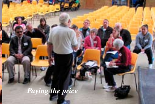
Paying the price