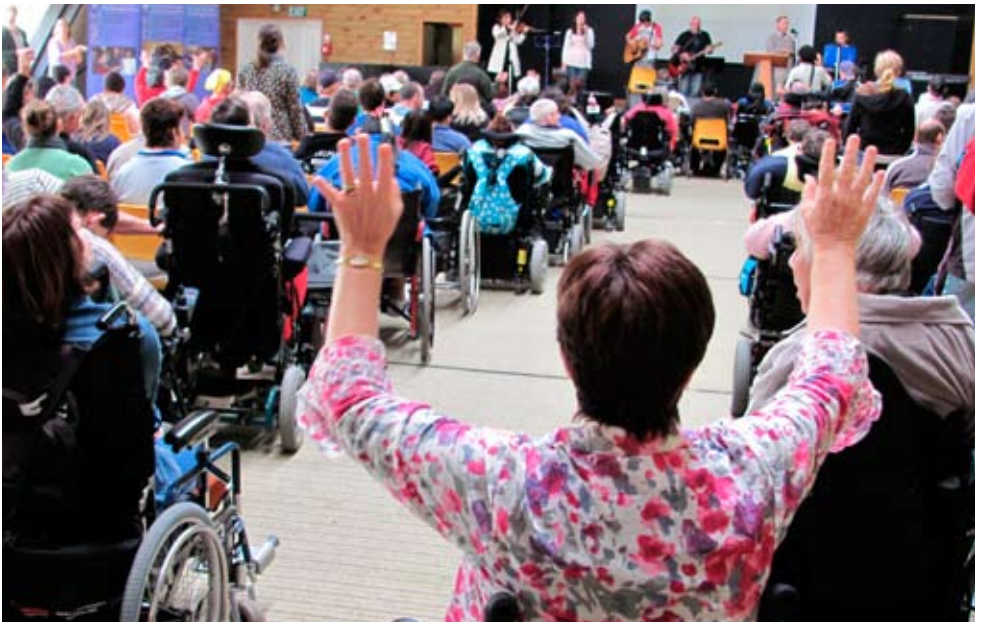
Praise and Worship