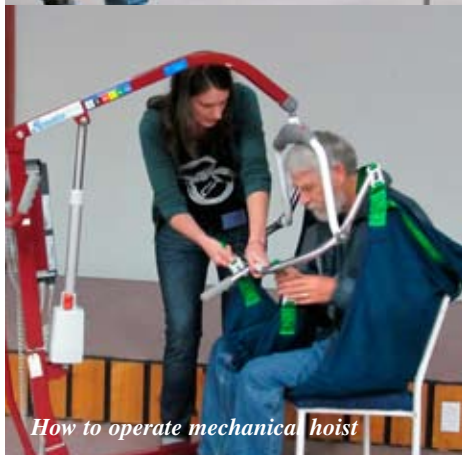
How to operate mechanical hoist