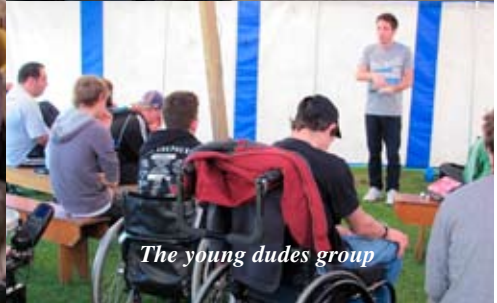
The young dudes group