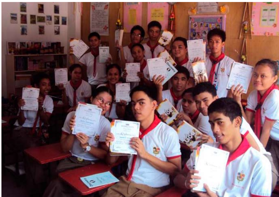
Deaf 4th Year High School students with their Bible, certificates, and booklets.

Just these few months ago, our school head gave us booklets to study and answer. It gave me more understanding and clear steps of how to become a Christian, and I am hoping now that I can teach it to other deaf. Last October we each received a Bible in English. I am so thankful to have my own Bible and I am patiently reading it. You have to realise that most deaf people have difficulty reading with understanding since we have never heard the language in written symbols. The Bible is also very helpful to me when we have a Bible verse to memorize. I see very clearly that I am doing something very valuable to God when I invite other deaf to attend the church. Glory to God.