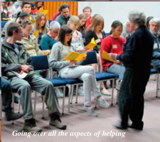
Going over all the aspects of helping