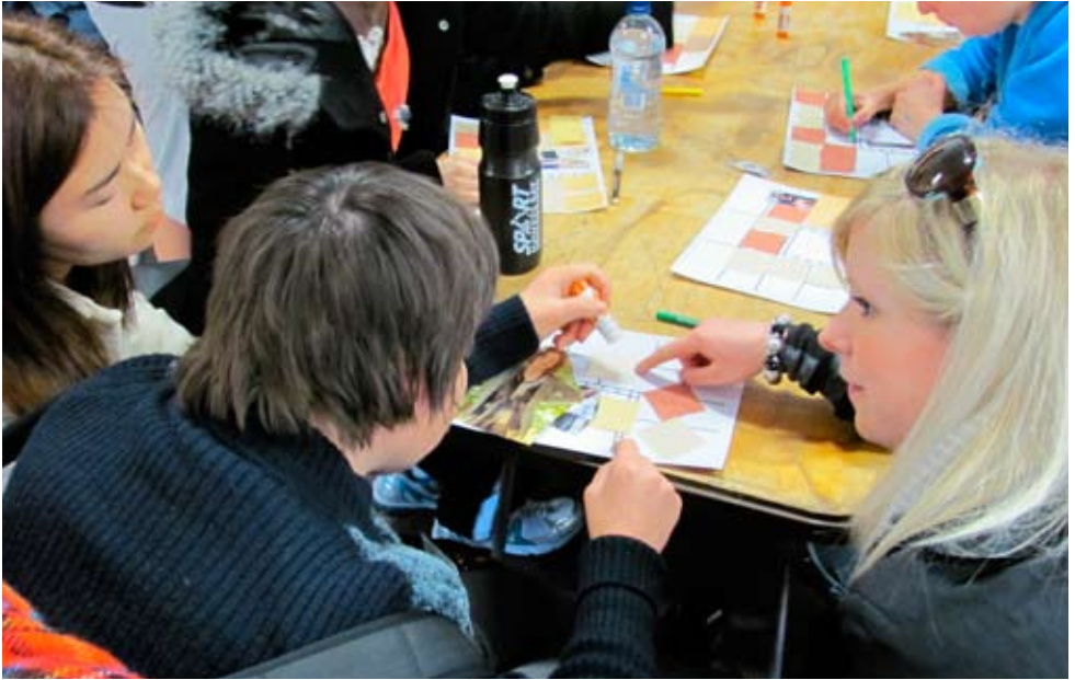
Craft activities are always very popular in the Joy Ministries group