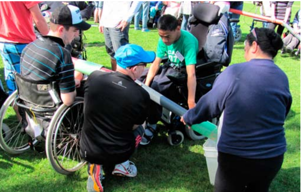
Water through the pipes - an ever-popular team contest