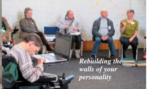
Rebuilding the walls of your personality