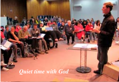
Quiet time with God