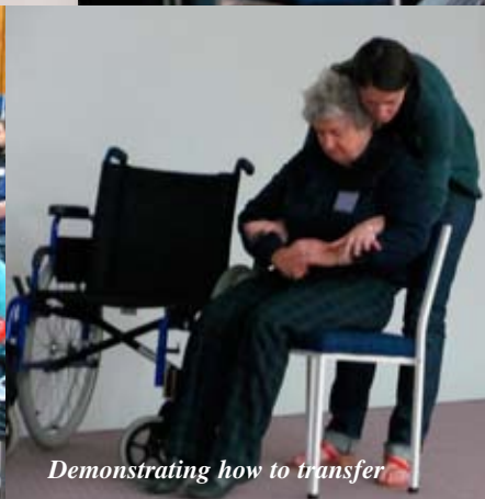
Demonstrating how to transfer