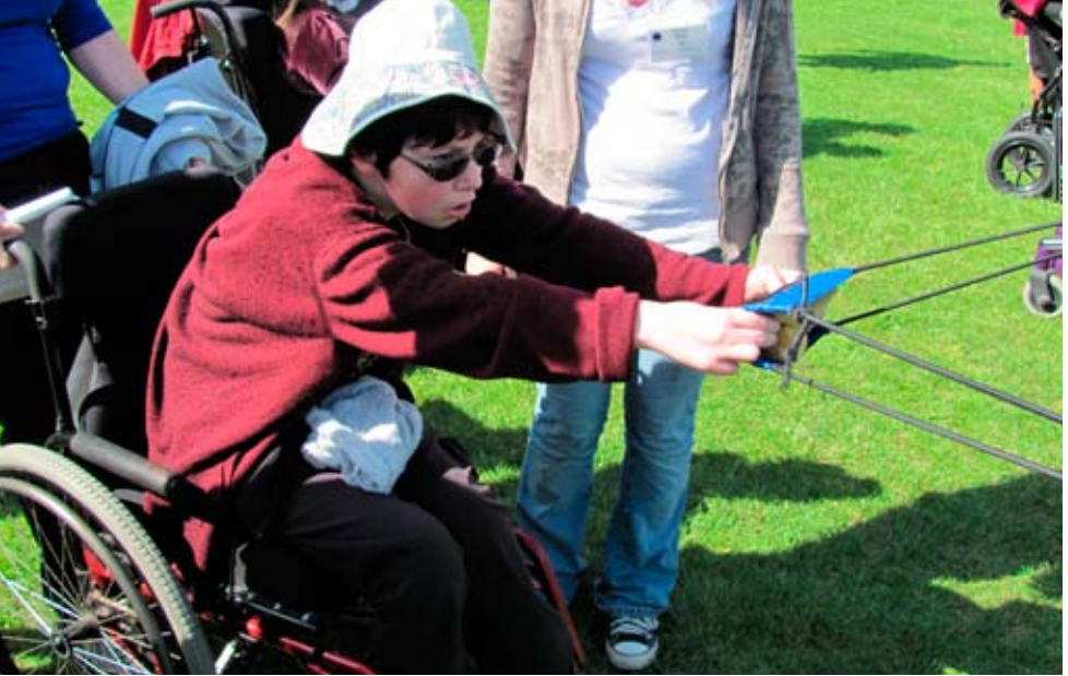
The Slingshot, a new activity at camp, proved to be a real "hit"